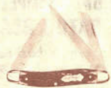
NO. 897UH SIGNATURE PREMIUM STOCK

Razor blade stainless hand honed. 3 blade premium stock. 3-9/16" closed.