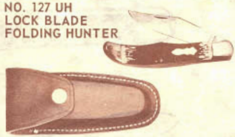
NO. 127UH LOCK BLADE FOLDING HUNTER

High-carbon stainless steel with heavy clip blade. Genuine form leather sheath. 5 1 / 4 " closed.