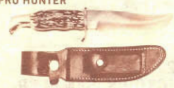
NO. 171UH PRO HUNTER

Extra heavy high carbon cutlery steel. Solid brass guard and rivets. Heavy genuine leather sheath and "piggyback" hone stone. Precise control. 9 1 / 2 " overall, 5 1 / 4 " blade.