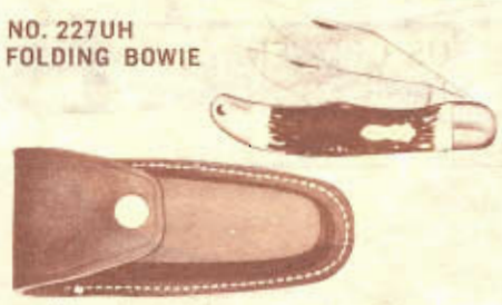
NO. 227UH FOLDING BOWIE

High-carbon stainless steel with heavy clip and boning blade. Genuine form leather sheath. 5 1 / 4 " closed.