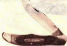
No. 1250T 5 1/4" closed. Lock Blade, With Sheath