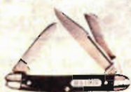
No. 1080T 2 3/4" closed.