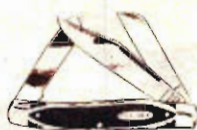
No. 80T 4" closed.