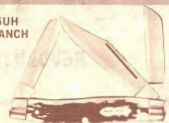
NO. 885UH KING RANCH

Full 4" husky premium stock, with high carbon stainless steel blades.