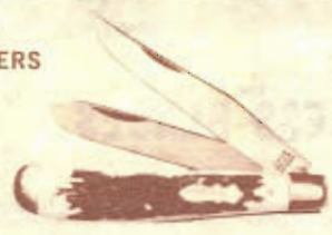
NO. 285UH PRO TRAPPERS

High-carbon cutlery steel. 2 blades — 1 long clip, an extra long spey. "Fat" Stag-lon ® handle. 3 3 / 4 " closed.