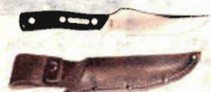
No. 150T 10 1/2" long overall